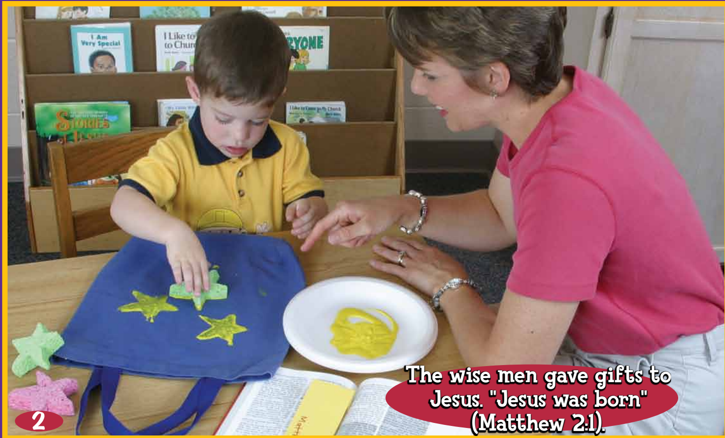
The wise men gave gifts to Jesus. "Jesus was born" (Matthew 2:1).