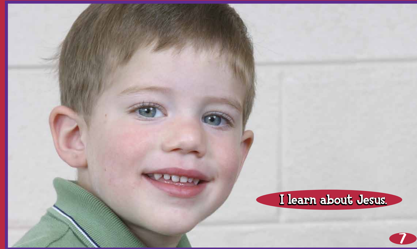
I learn about Jesus.